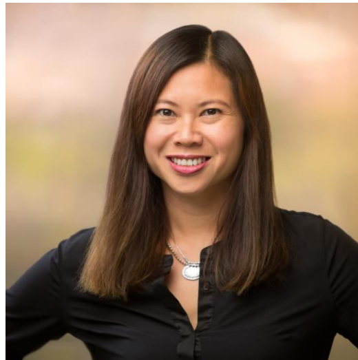
Hanh Le Weissberg Foundation