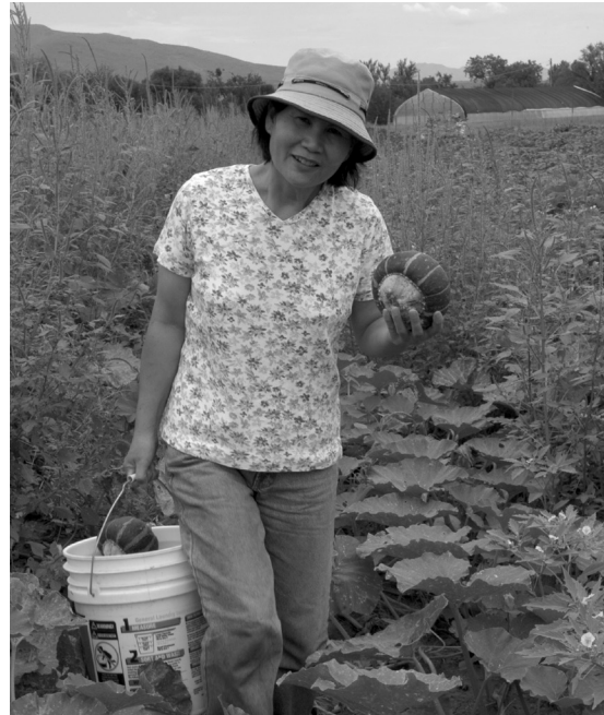
Forever Yong Farm

Over the 40-plus years that CFB has been in existence, it has grown into an anchor institution thanks to the breadth of its work in the region and the partnerships it has developed with community groups, farmers, philanthropy, elected officials, school districts, and other anchor institutions. Tucson has both unique opportunities and challenges because it is situated in a vast, rural border region. For example, there is only one major university and a few hospitals. CFB is starting the work of institutionalizing the anchor mission at their anchor partners' institutions. The Farm-to-Institution program was a good starting point for their anchor collaboration work. Now CFB is looking at how to engage new partners in equitable economic development work.