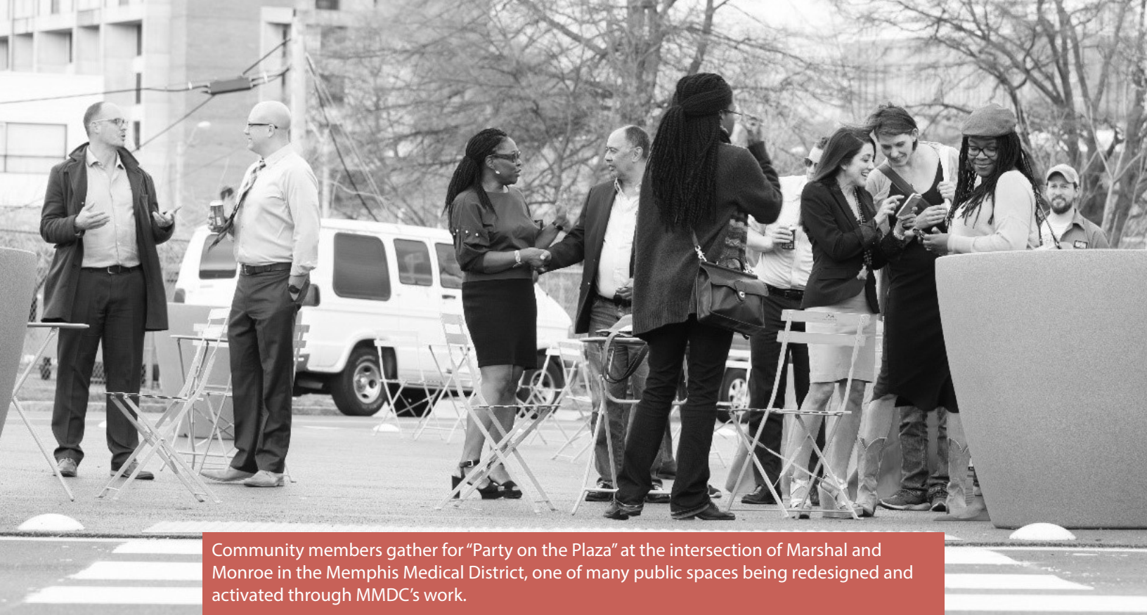
Community members gather for “Party on the Plaza” at the intersection of Marshal and Monroe in the Memphis Medical District, one of many public spaces being redesigned and activated through MMDC’s work.

The Memphis Medical District Collaborative (MMDC) serves as another example of the convening role of funders. MMDC’s launch in 2016 was built on nearly two years of intentional collaboration and groundwork initiated by the Hyde Family Foundation (HFF) and other local foundations. There had previously been various efforts to revitalize the city’s Medical District area, but insufficient coordination and resources hindered progress. HFF engaged the collaboration of the Medical District’s eight major anchor institutions to study the feasibility of an anchor strategy in the district. This resulted in a comprehensive analysis that presented a compelling case to anchor leaders for place-based economic development focus areas that could leverage their collective impact.