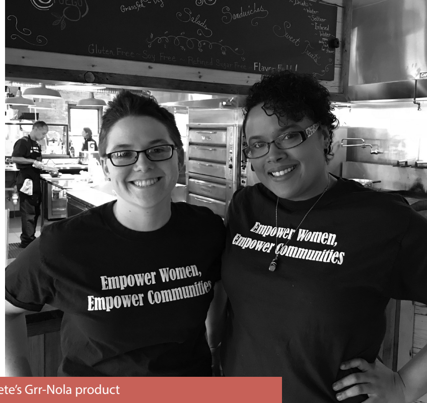
Poughkeepsie Open Kitchen participants, Pete's Grr-Nola product

justice. This means developing partnerships with anchor institutions, conducting civic engagement and public advocacy, and equitable community development by providing capacity-building grants, microloans, and supporting food and health enterprises.